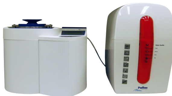
Fig. 1: AWT AutoClave Water

All components is of high quality to meet the standards of Adept Water Technologies products.