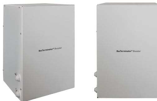
Fig. 1: BacTerminator® Booster

BacTerminator® Booster is produced according to the Medical Device Directive 93/42/EEC and EN ISO 13485.