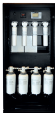
Fig. 3: BacTerminator® Mega Booster

BacTerminator® Mega Booster is produced according to the Medical Device Directive 93/42/EEC and EN ISO 13485.