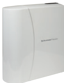
Fig. 2: BacTerminator® Booster2