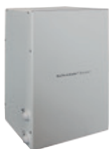
Fig. 1: BacTerminator® Booster1

BacTerminator® Booster is a specially designed unit, which allow you, to use your BacTerminator® Dental, as a centralized water treatment unit. It secures a high continuous water flow even when multiple dental units are connected to a single BacTerminator® Dental. BacTerminator® Booster is produced according to the Medical Device Directive 93/42/EEC and EN ISO 13485.